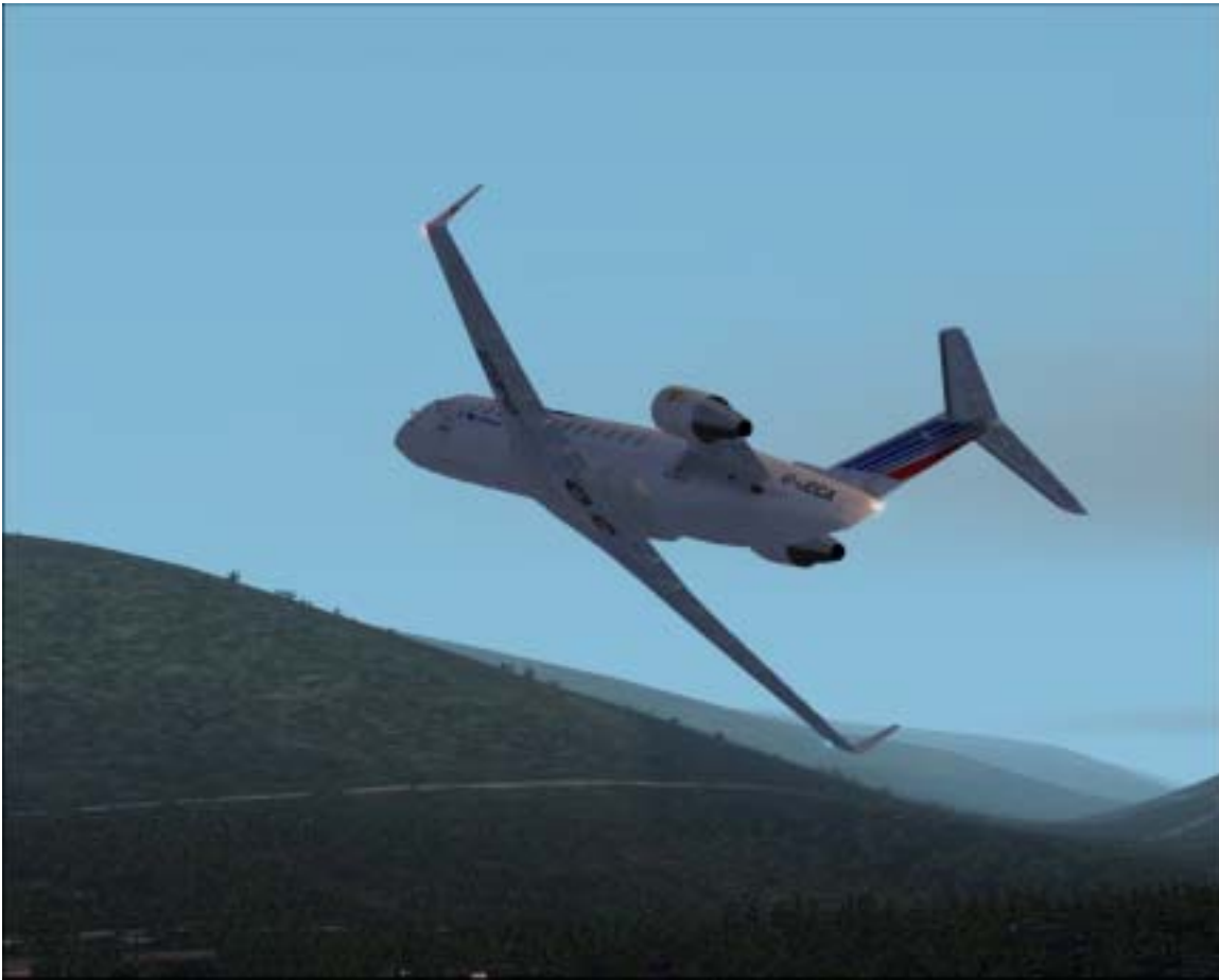
Scheme by Jaco Du Preeze